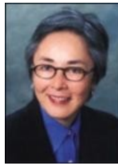
California State Senator District 21 Carol Liu