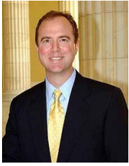
California Congressman 29 th District Adam Schiff