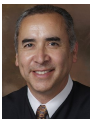
Pasadena Superior Court Judge Philip Soto