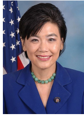
California Congresswoman 32 nd District Judy Chu