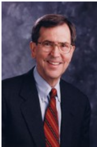
Mayor of Pasadena Bill Bogaard