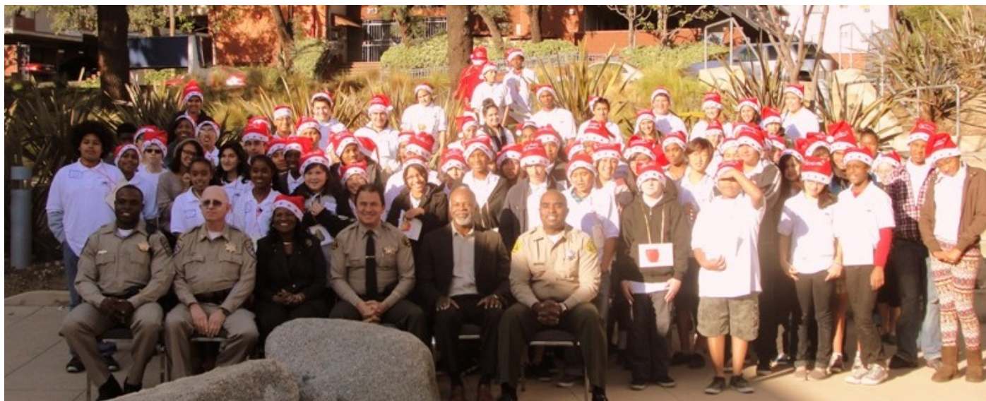
2011-2012 Bright Futures Scholars at the November 6th meeting with mentors from the Sheriff's Station.