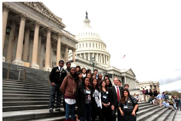
Bright Futures Scholars during the Washington D.C. Retreat with Congressman Adam Schiff